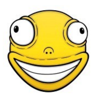
Find It - Books. Articles. Everything.

Observe if you will, the following experimentation: