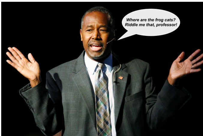
Ben "Heeere's Johnny!" Carson

Just Another Case of "I Don't Swim in Your Toilet"?