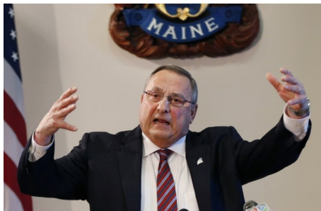
Caught a Fish this Big

You can schedule a date on the Library homepage.