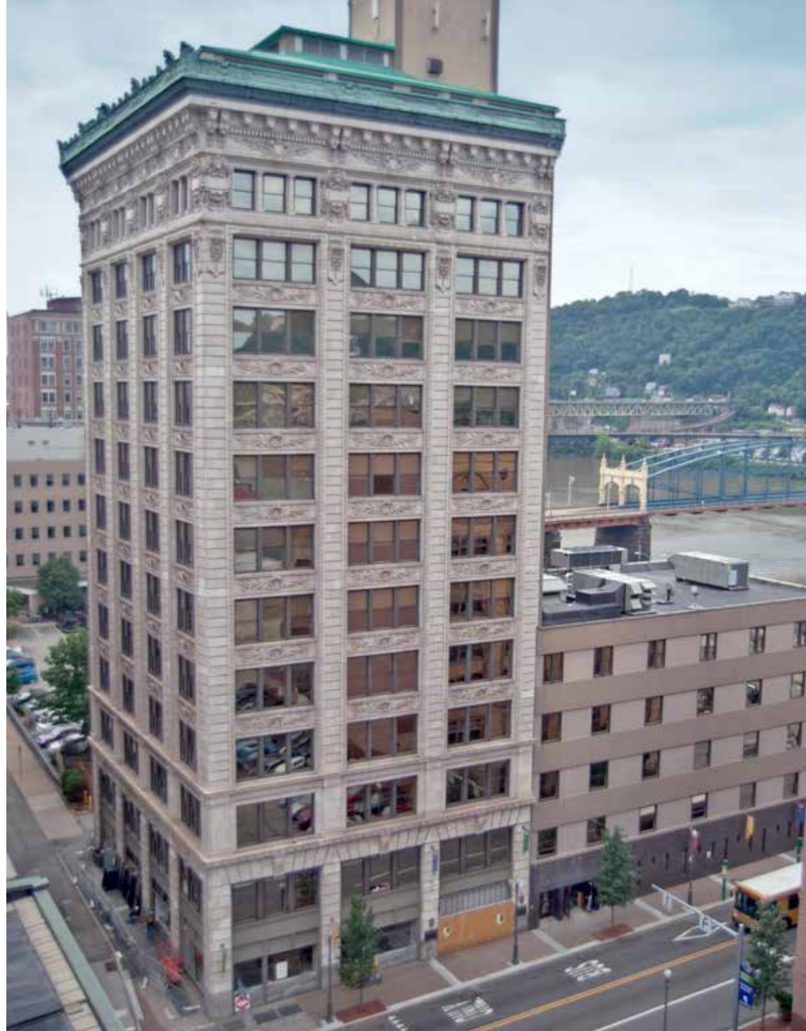
Right: A bird's eye view of West Penn Hall. Below: Renovations to the first and second floors took place during summer 2013.