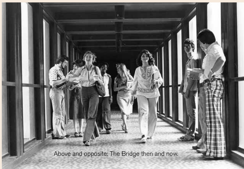
Above and opposite: The Bridge then and now.

(Editor's Note: To see a photo feature on today's theatre tech programs at the Conservatory of Performing Arts, visit page 12.)