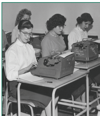
Publicity photograph (1950s) for Business Training College (BTC). BTC was Point Park's predecessor institution.