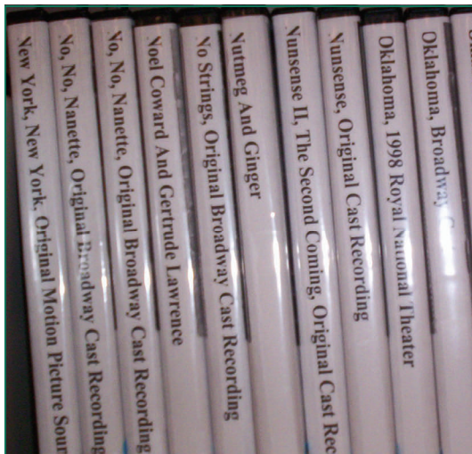
New cases make CD browsing much easier.

Look for many brand new titles. The library has recent popular movies on DVD as well as documentaries, clas-