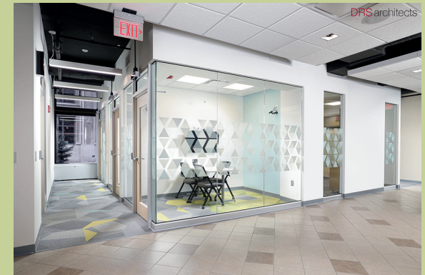
PAB Lab / Interview Rooms