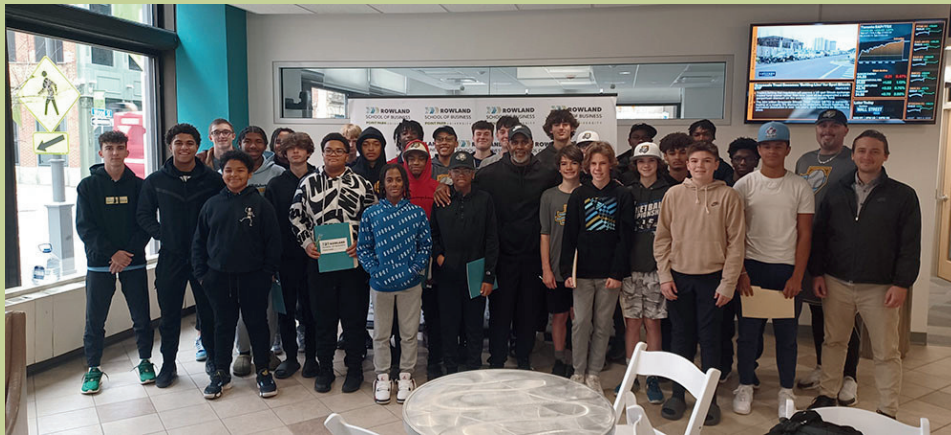
Students from Pittsburgh Hardball Academy and Pittsburgh Obama 6-12

Fosters equitable career and educational opportunities for youth and families from local communities