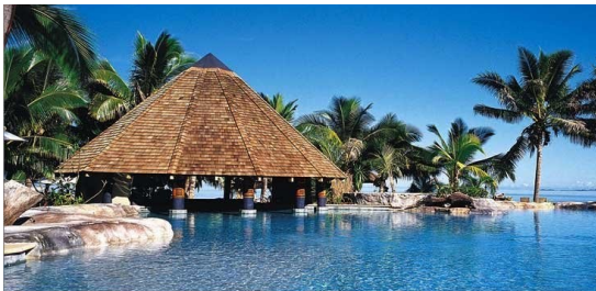
Image is an artistic rendering (a potential existence dependent upon the viewer's particular state of mind) and is not in fact, a factual depiction of the actual Nap Room as it exists in a state of reality.

The Nap Room is in the vault on the lower level of the Library.