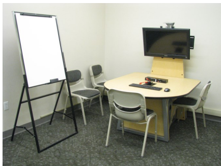
Study Room 1

Study Room 1 is equipped with a computer, monitor, Blu-ray player, screen sharing capability, a webcam and a whiteboard.