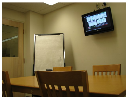
Study Room 2

Study Room 1 is equipped with a computer, monitor, Blu-ray player, screen sharing capability, a webcam and a whiteboard.