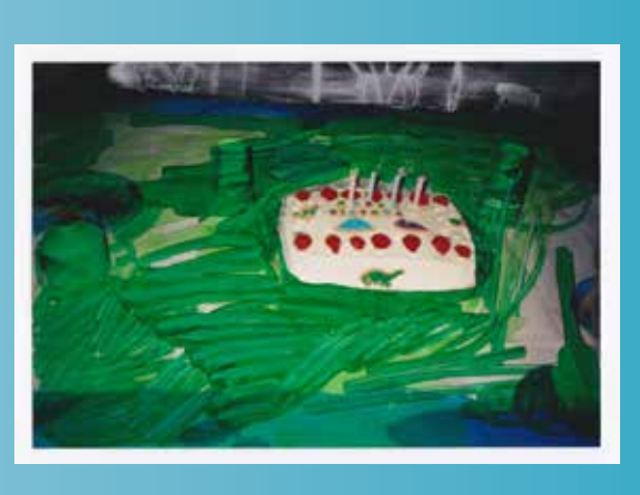
neighborhood earlier this year. Each had the opportunity to illustrate their own view of Point Park's hometown, Downtown